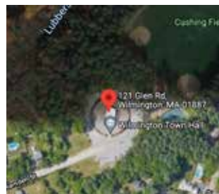
Town Hall Site 121 Glen Rd.