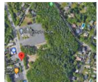
St. Dorothy's Site 130 Main St.