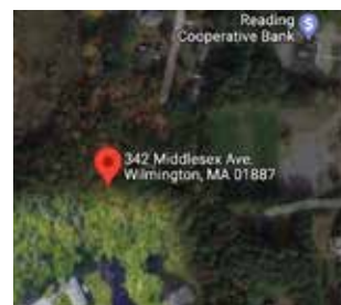
Whitefield School Site 342 Middlesex Ave.