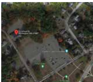
Swain Green Site 15 School St.

From the outside, it can appear as though not much progress is being made, but the Committee is working hard every week. The opinions of Committee members and the public are vital to the process and progress and these beginning steps are the cornerstones of a successful project! We look forward to continuing to bring information to the community as the project proceeds.