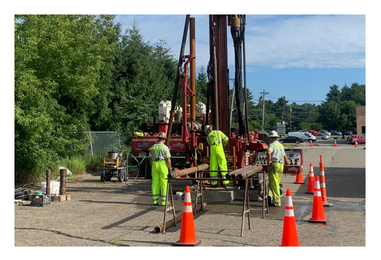
A drilling crew advances a bedrock boring on private property in South Wilmington in August 2022. Groundwater investigations on and off the Olin property continue under a 2007 legal agreement between EPA and the Potentially Responsible Parties ("PRPs").

More information about the Site can be found here: www.epa.gov/superfund/olin