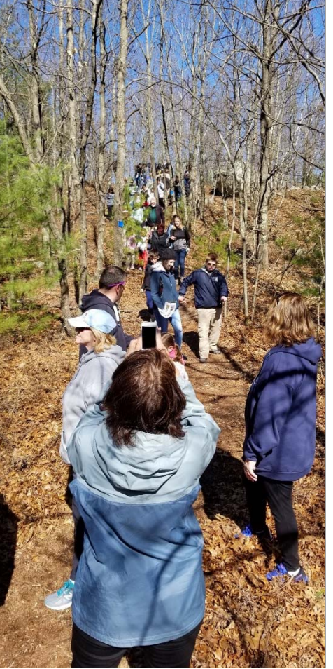
Town Forest Nature Walk

The Department and the Commission processed a number of Wetlands Protection Act applications in 2019, including industrial development, subdivisions and smaller residential and commercial projects. In addition to processing applications, the Commission adopted and updated Tree and Vegetation Removal Policy to provide an administrative process for removal of certain trees and set expectations for tree replacement.