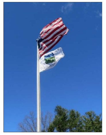
Donate Life Flag flies at Town Hall