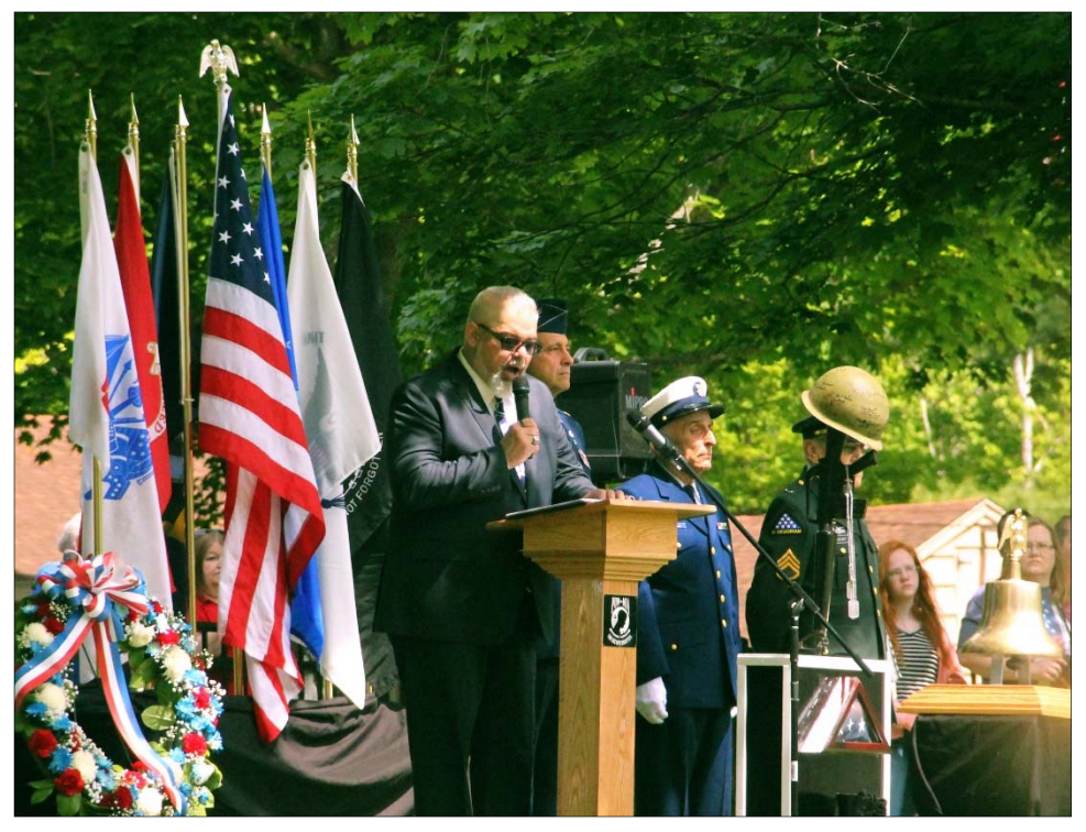
Memorial Day Ceremony at Wildwood Cemetery

We are grateful for the support received from town leadership, fellow employees and all board and committee members. We will continue our efforts to be helpful, diligent and precautionary in our roles as custodians of the Town's technology and data.