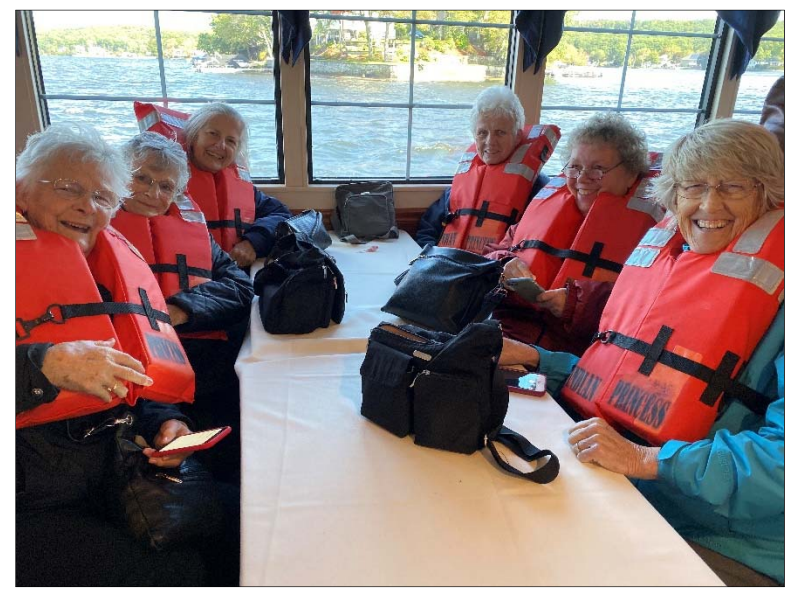
Day Trip to Webster, MA for a ride on authentic paddle boat, the Indian Princess, on Lake Chargoggagoggmanchauggagogg

In an attempt to be as accommodating as possible, we have an online registration system providing residents the option of registering for most of our programs and trips from the comfort of their home. Of course, registrations can still be handled in the Recreation Office by phone, mail or drop-off in the Town Hall night slot. Our newsletter is available online through the Town website by accessing Recreation, followed by the link for "Recreation Matters". Our newsletters are also available in Town Hall, the Wilmington Memorial Library and the Buzzell Senior Center. One of the most common requirements of the Recreation staff is to act as an information source. We answer a wide variety and large number of questions daily about local and regional services.