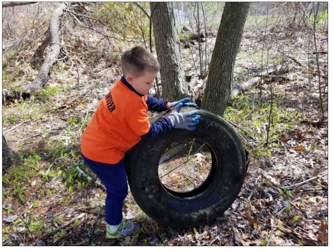
Annual Fall Clean-Up

In April 2019, the Conservation Agent provided a series of Earth Day events, including a Lecture on Wetlands and Conservation Land at the Library, a Town Forest Nature Walk and a community-wide spring clean-up day. The Department extends its thanks to the people who came out to both the spring and annual fall clean-up days. Also, in conjunction with Earth Day, the Department issued an updated Land Stewardship Handbook, which can be found on our webpage, and outlines how residents can volunteer to help maintain and care for trails and open spaces. Residents, businesses and organizations are encouraged to contact the Department if they are interested in volunteering for clean-up efforts, trail improvements or other open space initiatives in Town. Every bit helps and no effort is too small.