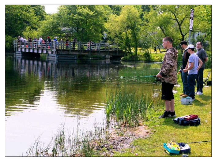
Fishing Derby at Silver Lake

Our holiday and seasonal celebrations enhance the sense of community and identify Wilmington as a unique town. These celebrations include the Easter Egg Scramble, Fishing Derby, Concerts