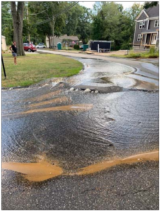
Water Main Break on Kelley Road

Whereas the old wells were located in wetlands and difficult to access, the new wells are located outside of the wetlands, providing easier access for future maintenance.