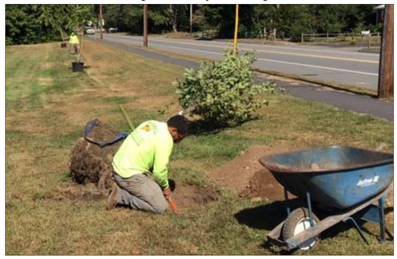
New trees planted at the Shawsheen School

Ten new trees were planted by the Department of Public Works. Four of them (3 River Birch and