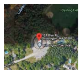
Town Hall Site 121 Glen Rd.