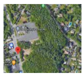
St. Dorothy's Site 130 Main St.