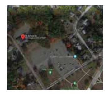
Swain Green Site 15 School St.

From the outside, it can appear as though not much progress is being made, but the Committee is working hard every week. The opinions of Committee members and the public are vital to the process and progress and these beginning steps are the cornerstones of a successful project! We look forward to continuing to bring information to the community as the project proceeds.