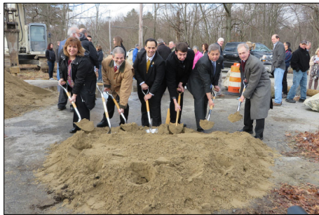
Yentile Farm Groundbreaking 2016

This is a "Carry in, Carry out" facility meaning no trash receptacles will be available in the park.